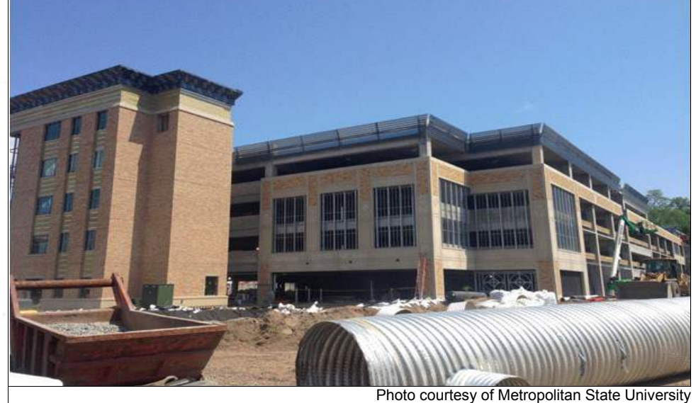
Metropolitan State University Parking Ramp, view from Maria Avenue.