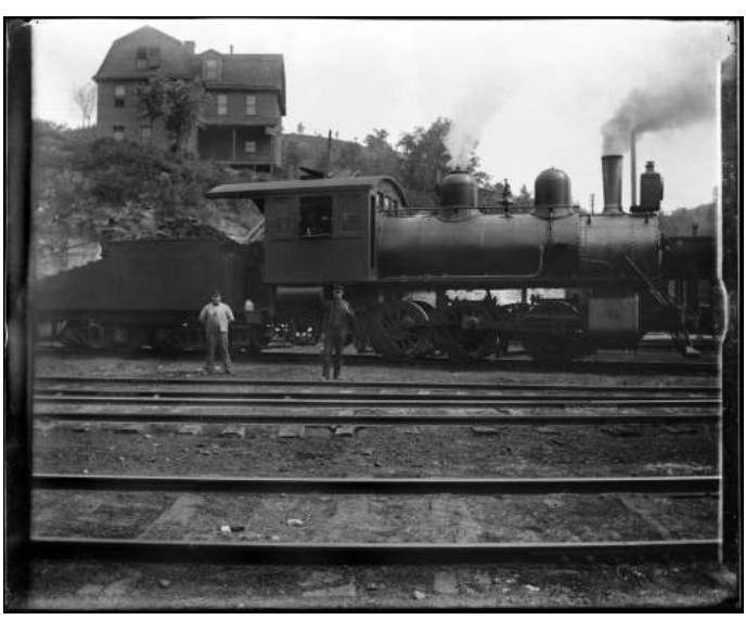
Minnesota Historical Society

100 Earl Street was the address of the Burlington Hotel. Here is a shot of the site in 1900. Little remains but a forgotten stairwell leading down to the train tracks below the