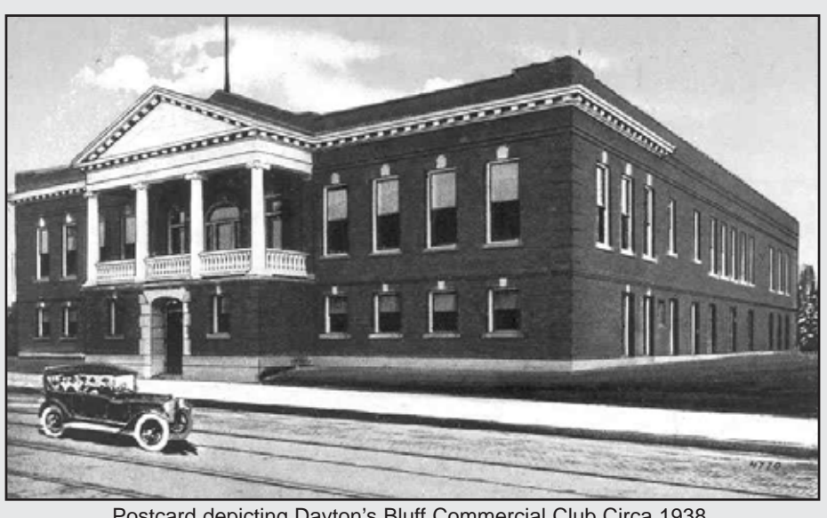
Postcard depicting Dayton's Bluff Commercial Club Circa 1938.

Social and cultural activities during the 1930's were numerous and, as before,