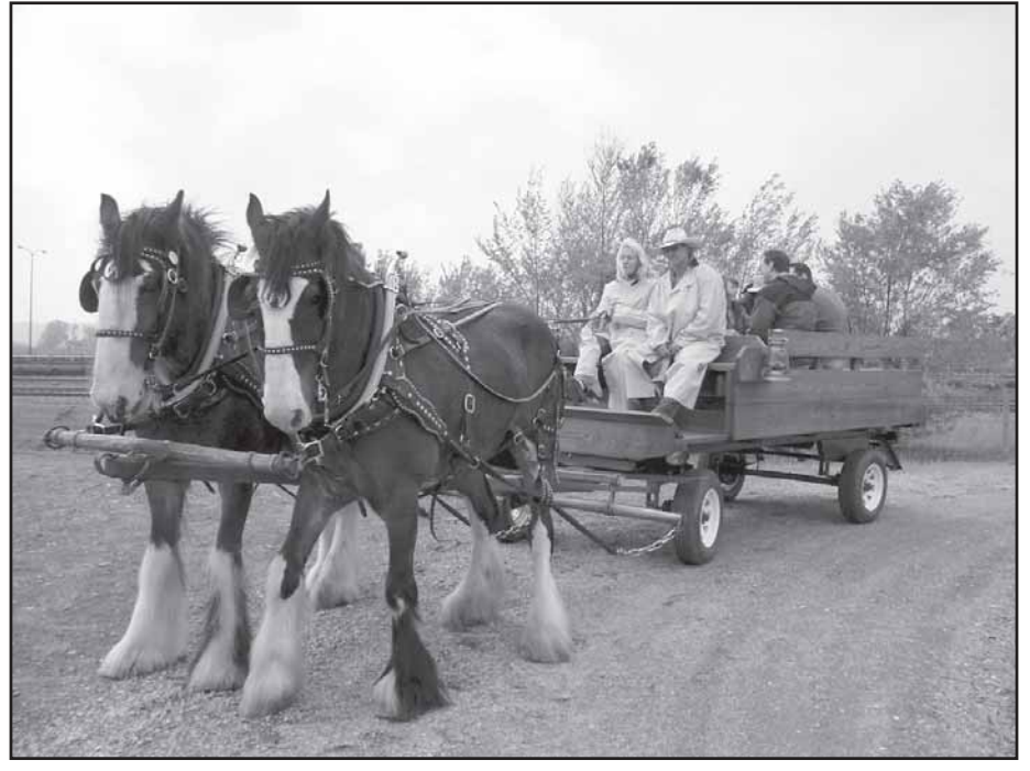
Horse and wagon rides in the Bruce Vento Nature Sanctuary.