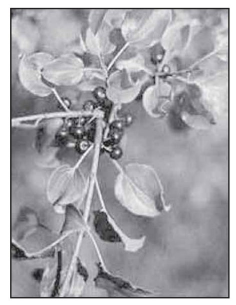
Mug shot of the "restricted noxious weed."

Buckthorn is detrimental to the health and future of forests, prairies, wetlands and parks. It reduces biodiversity, destroys wildlife habitat