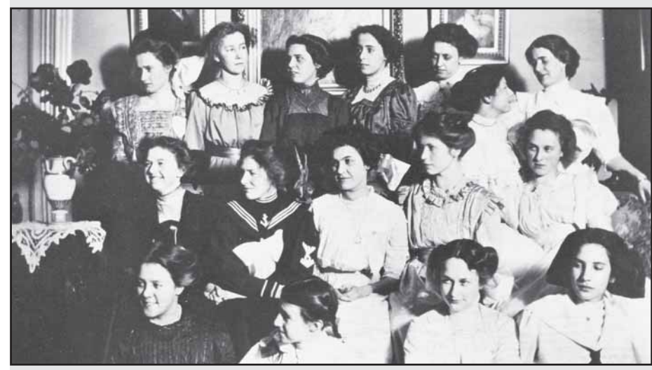
Young women of Dayton's Bluff German families sometime in the 1880s.

In addition, the first section of the Dayton's Bluff water works system used for fire fighting—was completed, protecting the Bluff up to Maple. In a test, it could throw a stream of water 150 to 160 feet. There were twentyseven hydrants, the Pioneer Press said, and "the applications for service