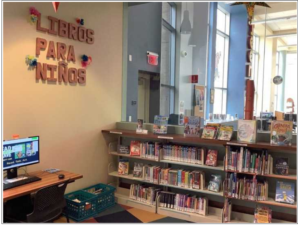
Dayton's Bluff Library

Check out sppl.org/hispanic-heritage to find more events like these, and discover picture books, movies, young adult reads, and other titles featuring Latine characters and stories.