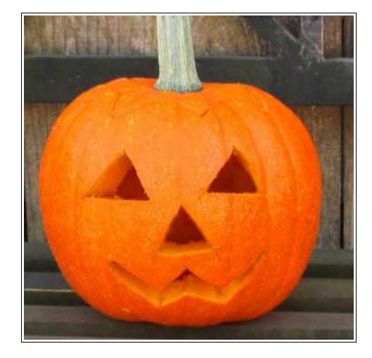
Happy Halloween from the Dayton's Bluff District Forum Staff!