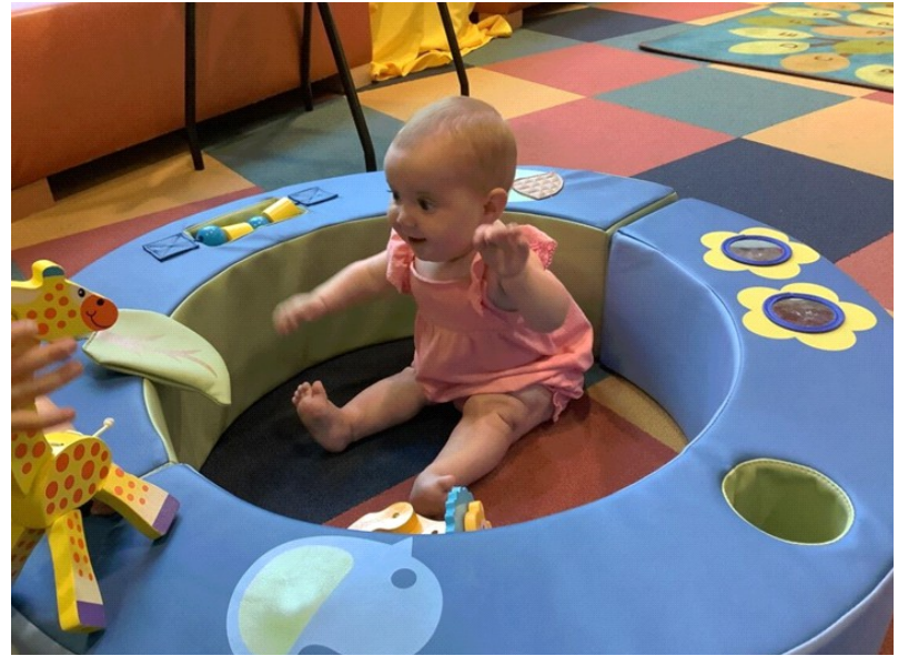
Dayton's Bluff Library