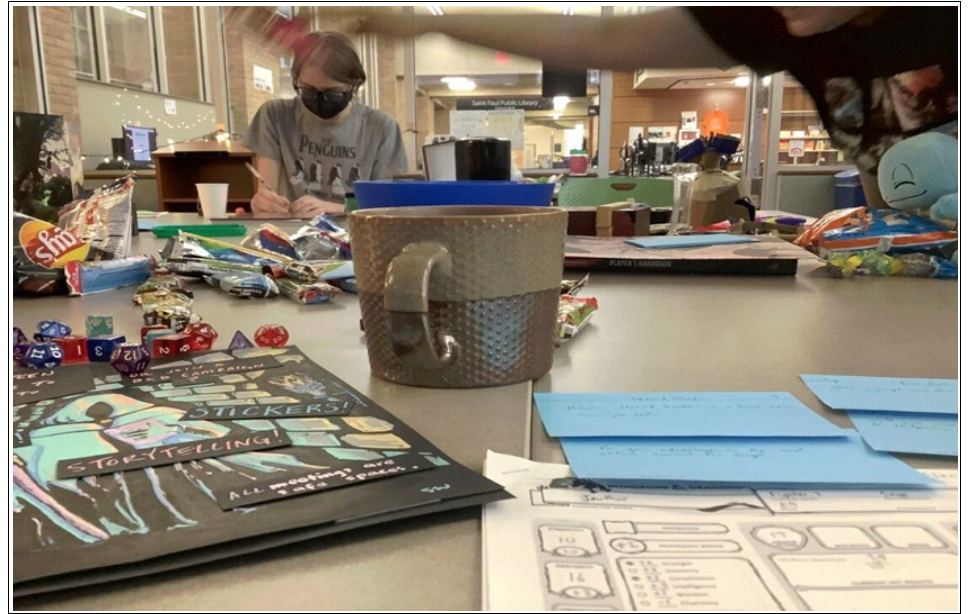
Dayton's Bluff Library

Current hours are available online at sppl.org/locations/DB/ or call 651-793-1699.