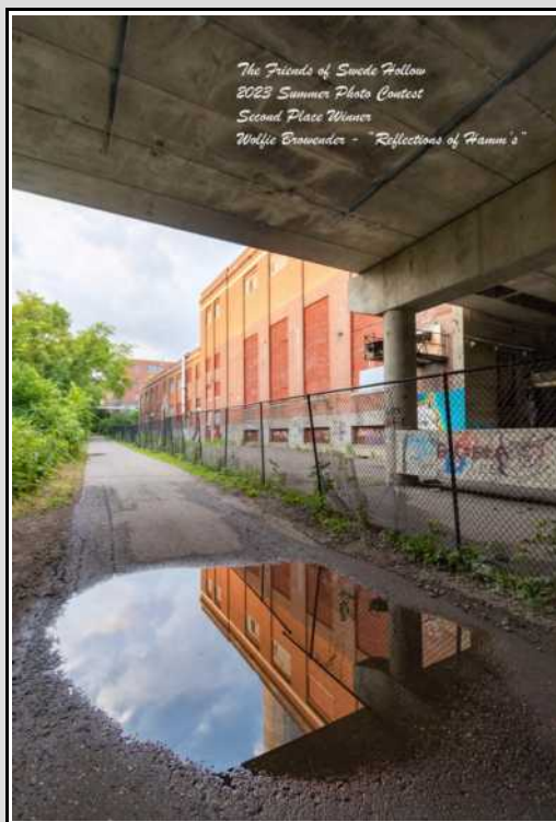
Second Place Winner: "Reflections of Hamm's" by Wolfie Browender