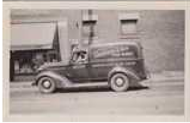
Photo found on Ancestry.com. It is a photo of the Damiani Grocery truck.

church was in the winter. How we children would be packed like sardines in the pews. We didn't mind; we kept warm that way. The only time we were uncomfortable was when in the spring our pockets were full of marbles... once in a while a few marbles would drop to the floor. Then Father Pioletti would stare in our direction.”