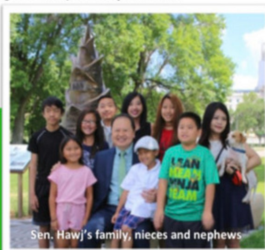
Sen. Hawj's family, nieces and nephews

For more information, contact 651.592.312 info@founghawj.com www.founghawj.com