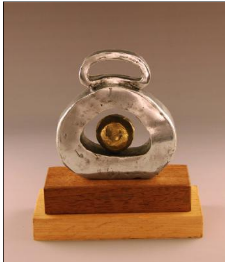
Metropolitan State University

Metropolitan State University, a member of the Minnesota State Colleges and Universities, is the Twin Cities' public, urban, comprehensive state university providing lifelong learning, and competitive academic and professional degree programs at the bachelor, master and doctoral levels.