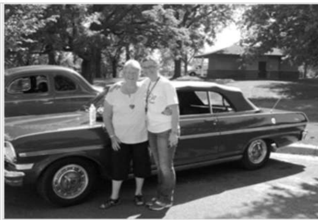
Cerenity Senior Care