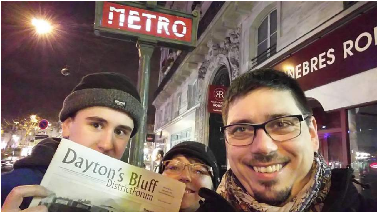
Several readers sent us pictures of themselves reading our newspaper on their travels. If you'd like to do the same, please email photos to editor@daytonsbuff.org .