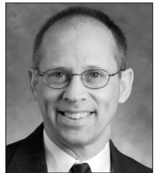
State Representative SHELDON JOHNSON

The East Side Open Market features more than the community supported agriculture of Urban Roots and Dream of Wild Health. It will have live music, food vendors, and goods for sale such as jelly from Just Jelly, Blue Moon wooden bowls, Decadent Goodies from D'Tid's and local honey. Come bring your kids and join your neighbors for the best farmer's market on the East Side!