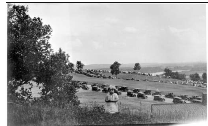
Minnesota Historical Society

This 1925 photo is of the steep stone slope leading to the airway beacon and the pavilion at the end of Earl Street. The beacon itself wasn't constructed until 1929.