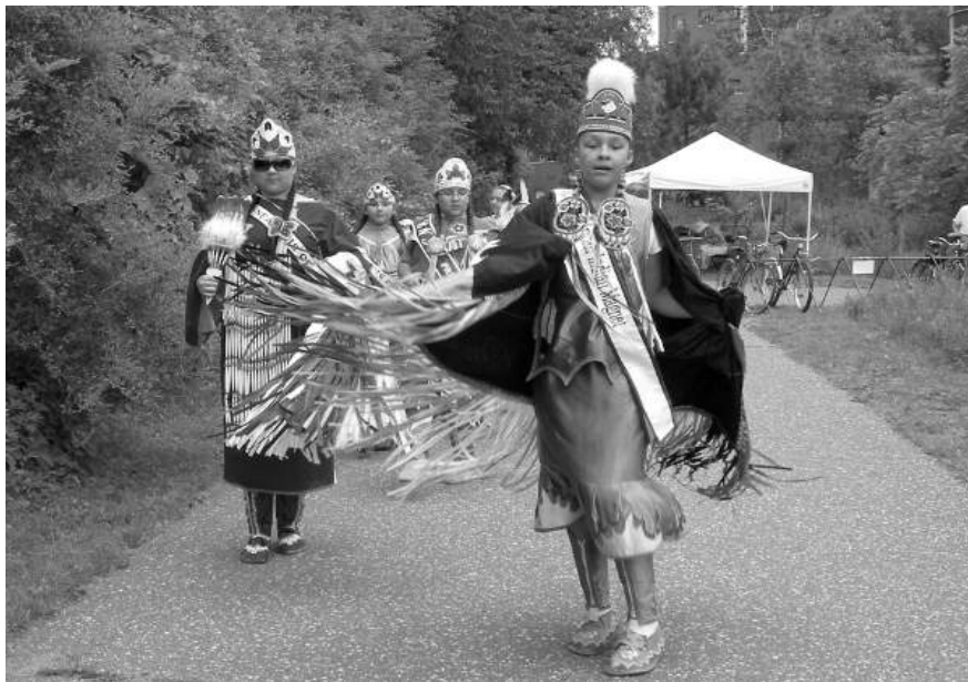
American Indian Magnet School students perform at Art in the Hollow

There is still room for artists, performers, and sculptors to apply. Please visit: www.artinthehollow.org or facebook.com/artinthehollow