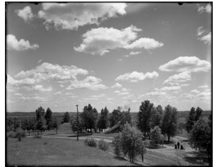
Minnesota Historical Society

The mounds from which the park takes its name, date back thousands of years to an ancient Native American culture known as the Hopewell. The Mounds themselves are some of the largest in the entire region, once numbering over 30 mounds, a total of only six survive today. The rest were rather callously destroyed in the late 19th century. The first photo shows the park as it appears today, while the second is a historic photo of the park circa 1910.