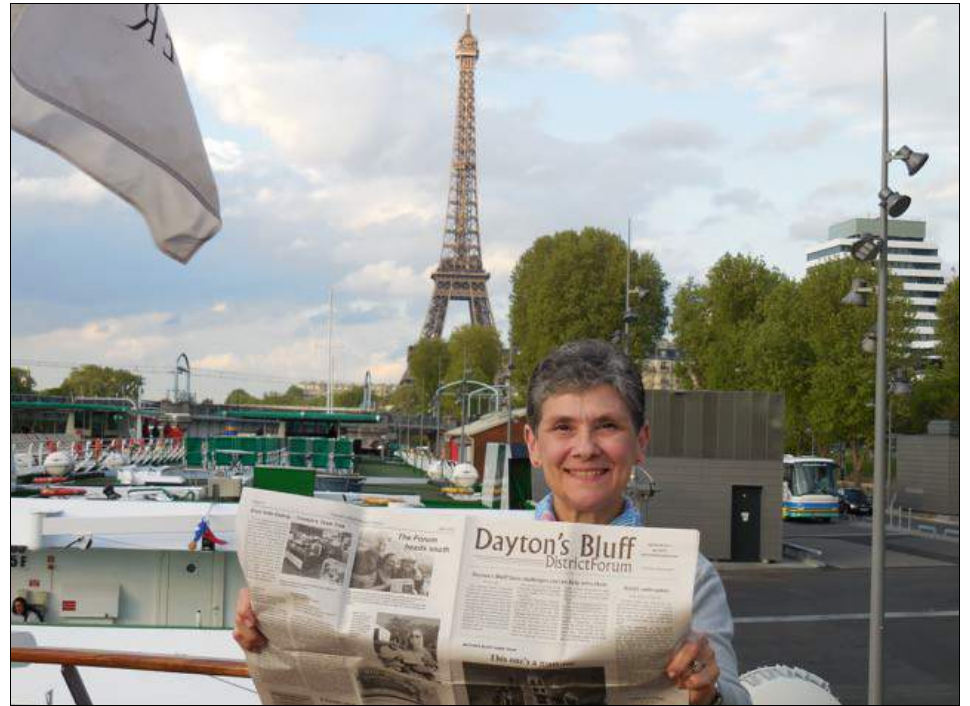
Several readers sent us pictures of themselves reading our newspaper on their travels. If you'd like to do the same, please email photos to editor@daytonsbuff.org .