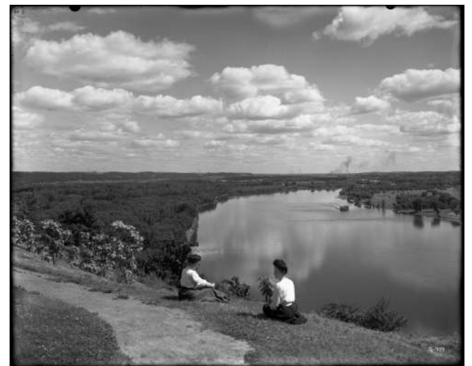
Minnesota Historical Society

This month's issue features a look south east from the top of the bluff near the pavilion in 1910, pictured above.