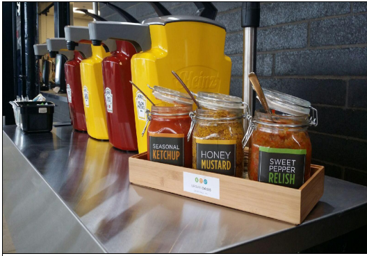
Urban Oasis Healthy craft condiments now featured at CHS Field.