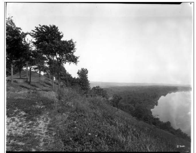
Minnesota Historical Society

This shot from the end of Earl Street, circa 1910 looks southeast along the river with the mounds in the foreground.