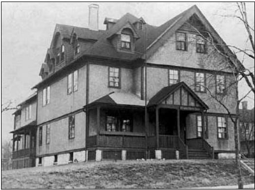
Minnesota Historical Society

If you grew up on the East Side and remember seeing the Crispus Attucks Home, or possibly interacting with some of its residents, please send us a story for the next issue. You can email it to editor@daytonsbluff.org . To read a full history of this former African American East Side landmark, type some or all of the following into a Google search: Paul Nelson; "Orphans and Old Folks: St. Paul's Crispus Attucks Home" Minnesota History 56.3 (1998).