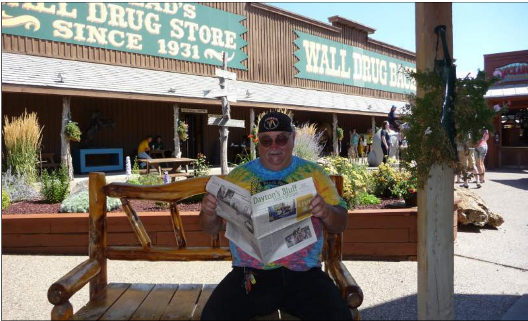
Several readers sent us pictures of themselves reading our newspaper on their travels. If you'd like to do the same, please email photos to editor@daytonsbluff.org .