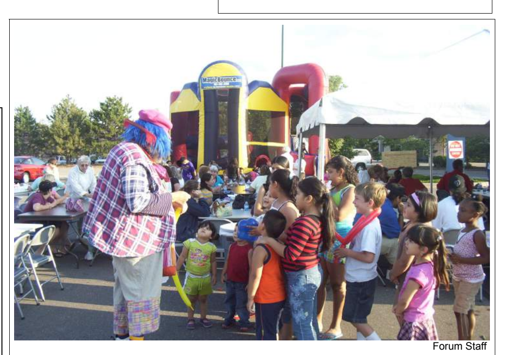
A clown entertains children at last year's National Night Out.