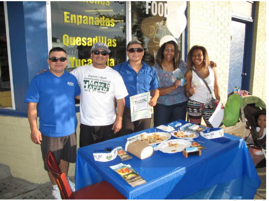
A group poses together at the "Make it Happen on E. 7th Street" event in 2012.

On Friday, August 21, from 5:00 p.m. to 9:00 p.m. E. 7th Street between Minnehaha and Forest will be closed, ensuring participants easy access and navigation of the 100 plus street vendors and business exhibitors. Using the whole street means everyone will be up close and personal with the musicians, dancers, food vendors, and local artists. Get your dancing shoes out, lick your chops, and get ready to enjoy the best of the East Side.