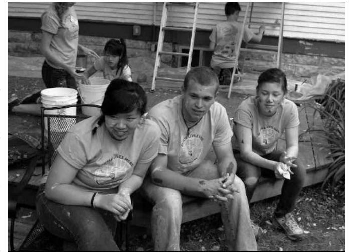
Urban CROSS 2013

During the second week of June, teams of youth demonstrate the love of God through serving the people of St. Paul's residential East Side.