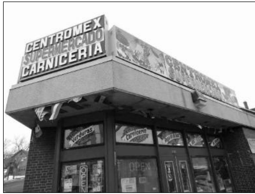
Above: Centromex Supermercado, now under new ownership, is located at 816 East 7th Street, at the corner of Arcade and 7th Streets.