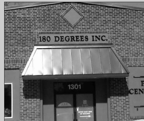
Above: Part of the facade of 180 Degrees, at 1301 East 7 th Street.