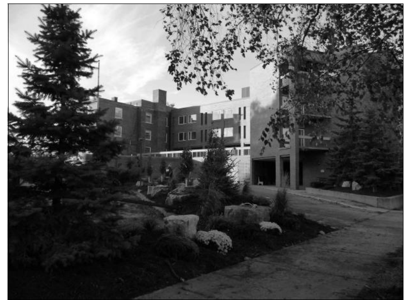
Above: Dellwood Gardens, offering assisted-living and memory-care options, will open in early 2014.