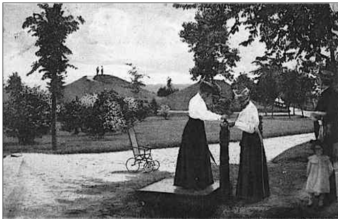
This vintage postcard shows people standing atop an Indian Mound in St. Paul.

I knew that early attitudes toward the Indian Mounds were lamentable – destruction of the burial sites, paths up the remaining mounds, people standing on them and sightseeing-- but this was the first time I knew of someone actually sticking a pole into one. Well, almost. For a long time during my lifetime, there were electric poles running through the park; one of them was partially placed in the side of a mound. This remained the case into the 1990s, until the electric company was forced to remove them by a state law. And that really was troublesome.