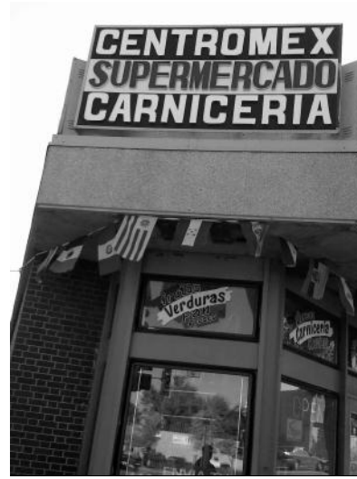
Centromex Supermercado is located at the corner of Arcade and 7 th Streets.