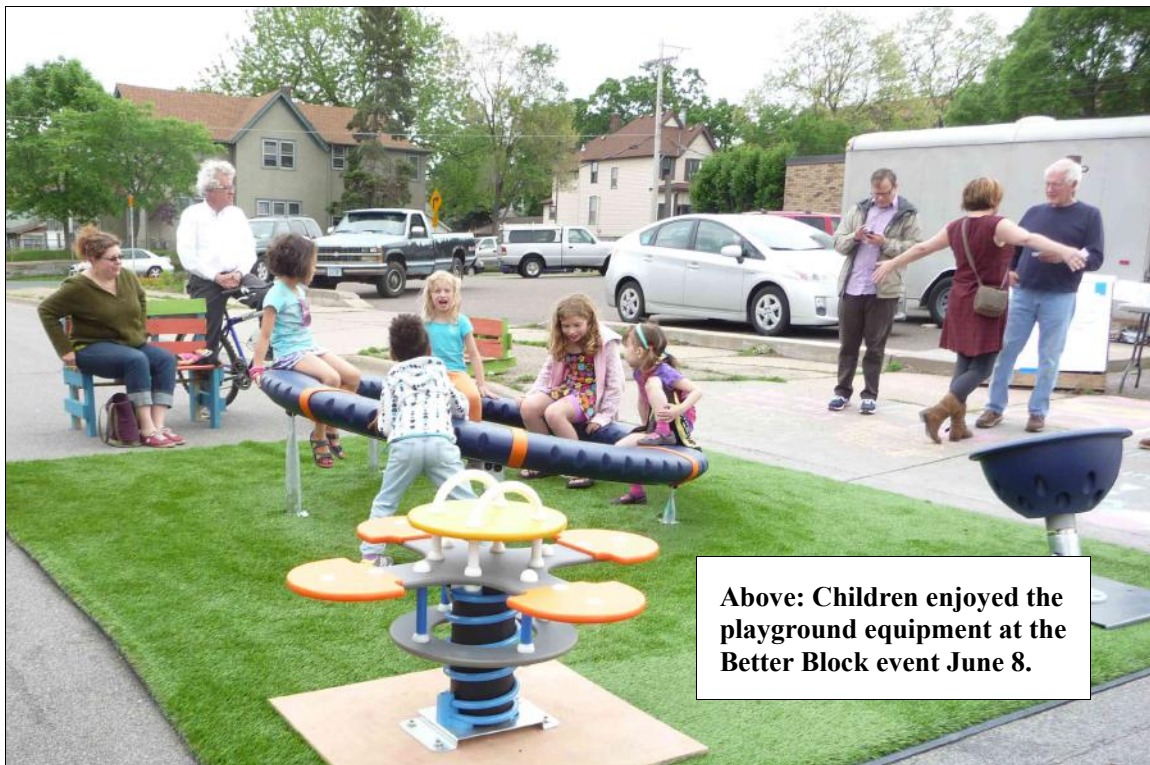
Above: Children enjoyed the playground equipment at the Better Block event June 8.