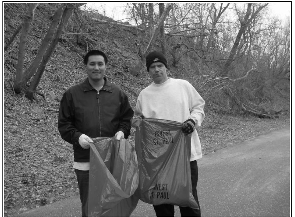
Below: Volunteers working on the Swede Hollow Clean Up. Over 30 volunteers worked at removing trash from many of the nooks and crannies in Swede Hollow.

Most of our local parks could use a helping hand this spring! Gather a broom, gloves, and trash bags to bring on your next walk, and make a difference in your neighborhood.