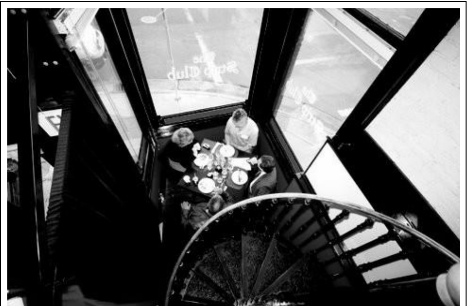
A bird's-eye glimpse of the classic décor of The Strip Club restaurant, which hosted the 2011 Dayton's Bluff Community Council Fundraiser.