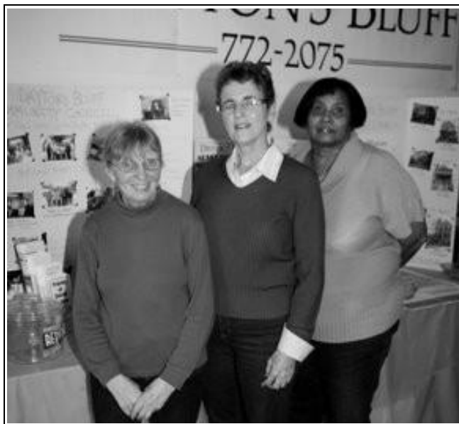
Dayton's Bluff Community Council staff poses for a picture in the Council office.