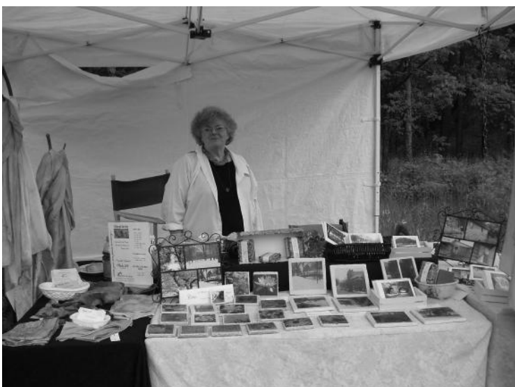
An artist displays her creations for sale during last year's Art in the Hollow festival.

Have a legal question, but feel intimidated by making an appointment and traveling to an attorney's office to ask? The Dayton's Bluff District Council's Arts, Culture and Outreach Committee has assembled a group of local attorneys to speak about many different areas of the law, including wills and estates, bankruptcy, divorce and child custody, personal injury and workers' compensation, and criminal law. Metropolitan State University has graciously allowed us to use its space to hold this legal forum. This is an opportunity for you to listen to an attorney and ask questions in a casual, no-cost, no-obligation setting. You are welcome to attend on Monday, May 23, from 6:00 - 8:00 pm at Metropolitan State University in the Library and Learning Center, Room 302.