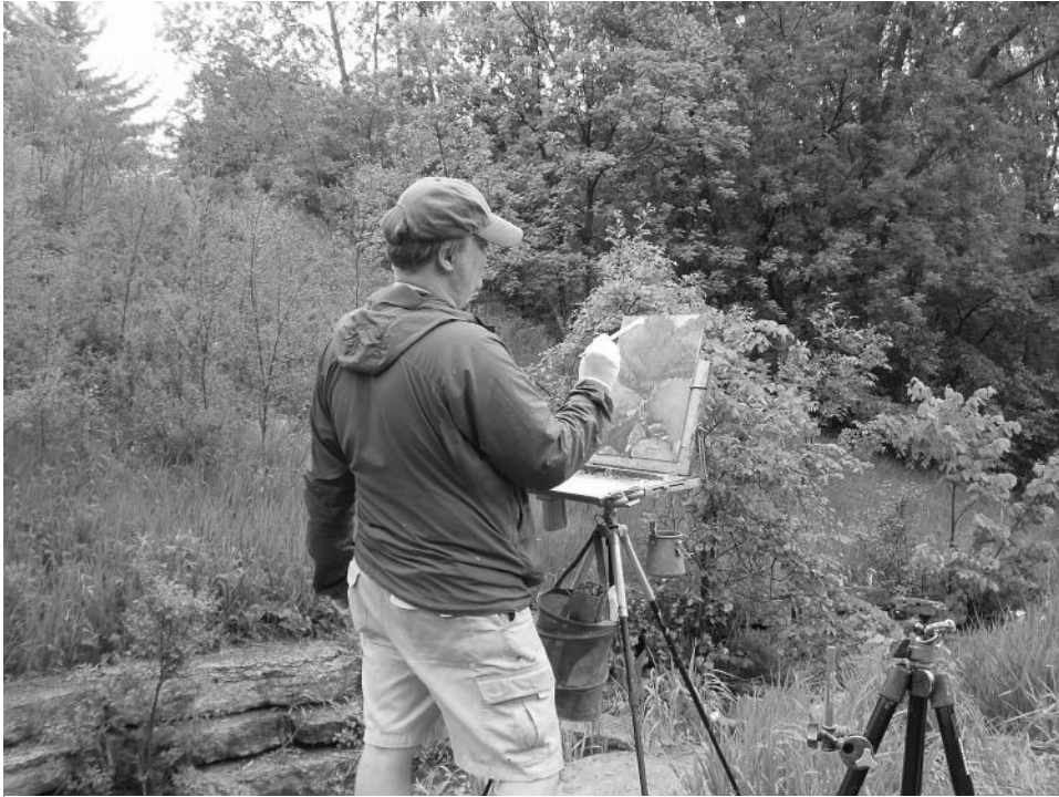
An artist paints the beautiful Swede Hollow landscape at the 2010 arts festival.