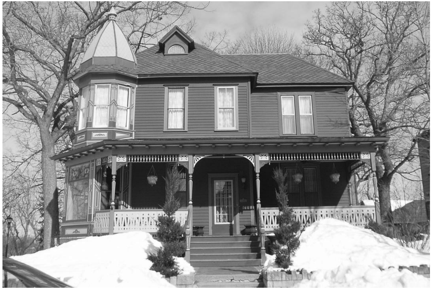
This home, at 613 North Street, sits on a corner lot adjacent to Swede Hollow Park. In the summer, its red shingles are complemented by lovely flowers and landscaping.