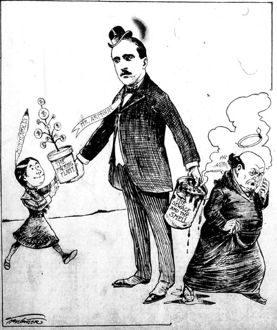
MR. ARMOUR -- "For you, Miss Minneapolis, this packing plant. For Brother St. Paul, I have another nice present."