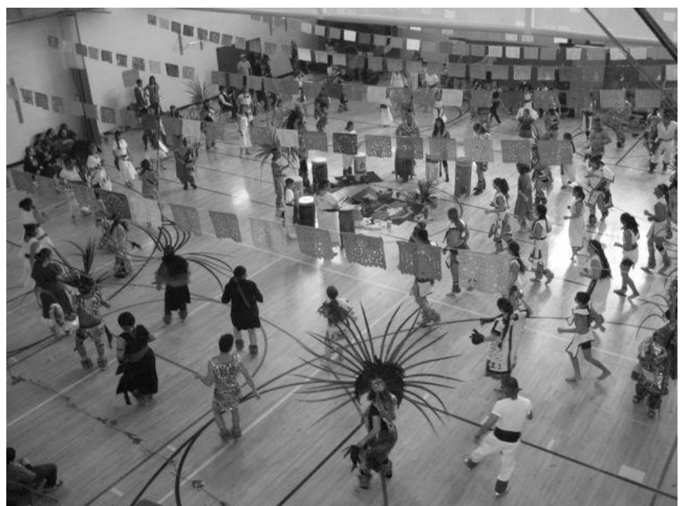
The first traditional Mexican New Year in Minnesota was celebrated at the East Side YMCA on Arcade Street on March 12th. The free events featured a traditional Aztec/ Mexican dance ceremony honoring the new year. There were drummers and dancers from five different area organizations. There were also games and prizes for kids, arts activities for the whole family, and free food.

825 E. Seventh Street Saint Paul MN 55106