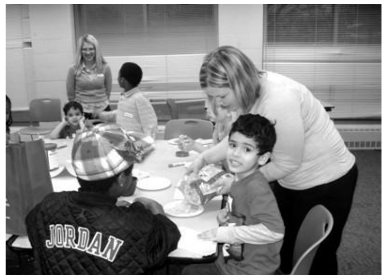
Rec Check participants work with Junior League volunteers in their Kids in the Kitchen program.

The Junior League has been very generous with its time and dedication, providing numerous fun activities for our youth at Dayton's Bluff Recreation Center. Kids in the Kitchen is a program that teaches healthy eating and provides youth with a cookbook to take home and share recipes with their families. The League also hosts a Family Reading and Game Night every third Thursday of the month from 6:00 – 8:00 pm at the recreation center. Dinner is provided. This is a great way to spend quality time with your children.