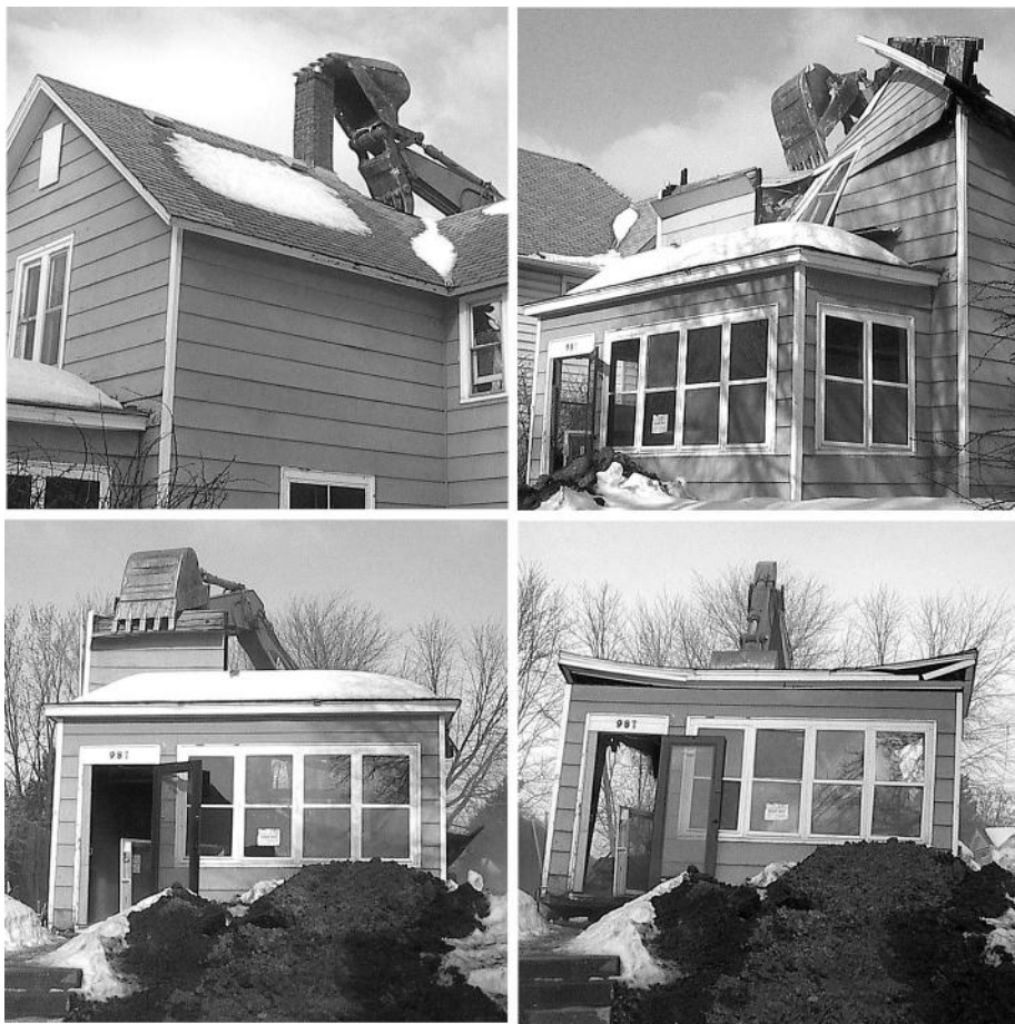
This house on the 900 block of Euclid was demolished in less than two hours on Valentine's Day. The dreams of its new owner were destroyed with it.