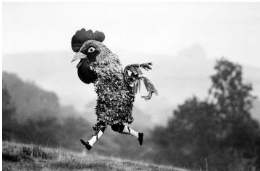
A local chicken cavorts freely, testing out the new Mounds Park off-leash chicken run.

Parks and Recreation Department and members of BAUCK will be hosting a public meeting to explain the way this experimental program will be