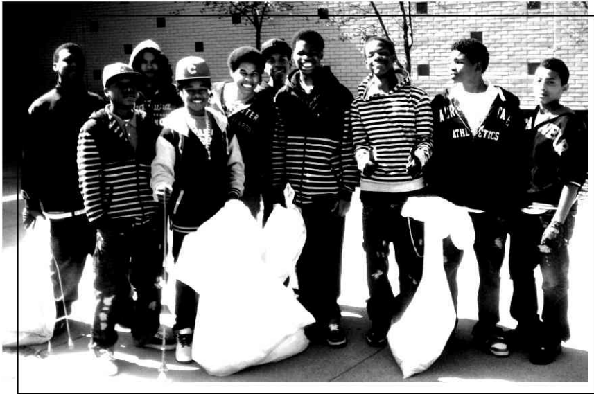
▲ Members of YIT, armed with bags and pick-up tools for the clean-up.