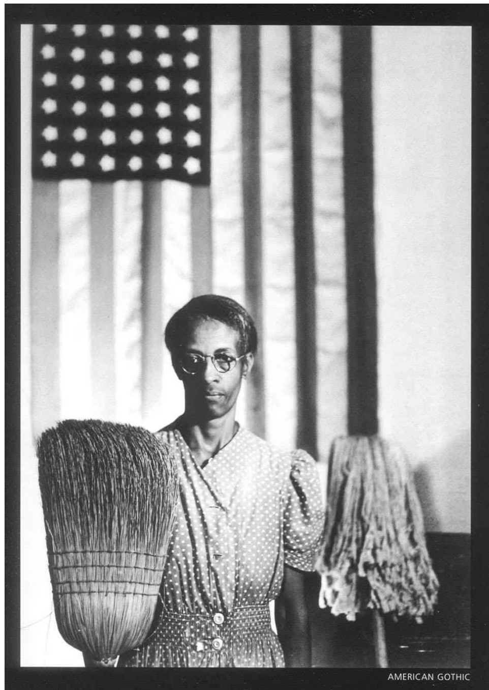
"American Gothic" by Gordon Parks

Metropolitan State University ( www.metrostate.edu ), a member of the Minnesota State Colleges and Universities system, provides high-quality, affordable academic and professional degree programs at the bachelor's, master's and doctorate levels. It is the only state university in the Twin Cities metropolitan area.