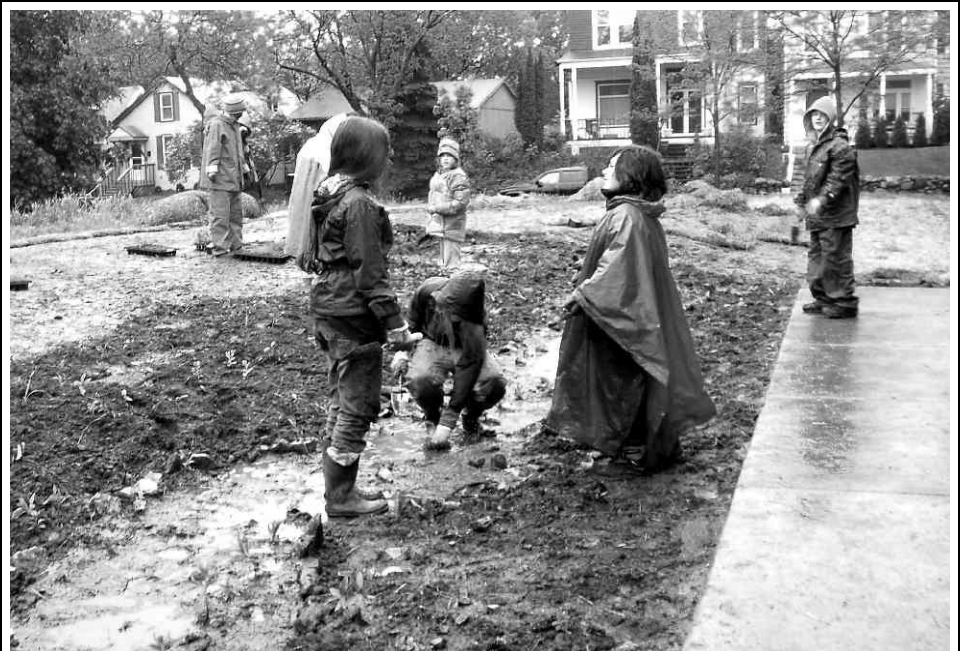
A rainy day constructing a rain garden at Twin Cities Academy Middle School

St Paul Eastside Seventh-day Adventist Church 1052 Minnehaha 651-771-2872 www.stpauleastside22.adventistchurchconnect.org