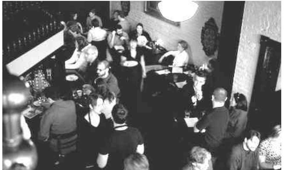
District Council fundraising dinner at the Strip Club restaurant