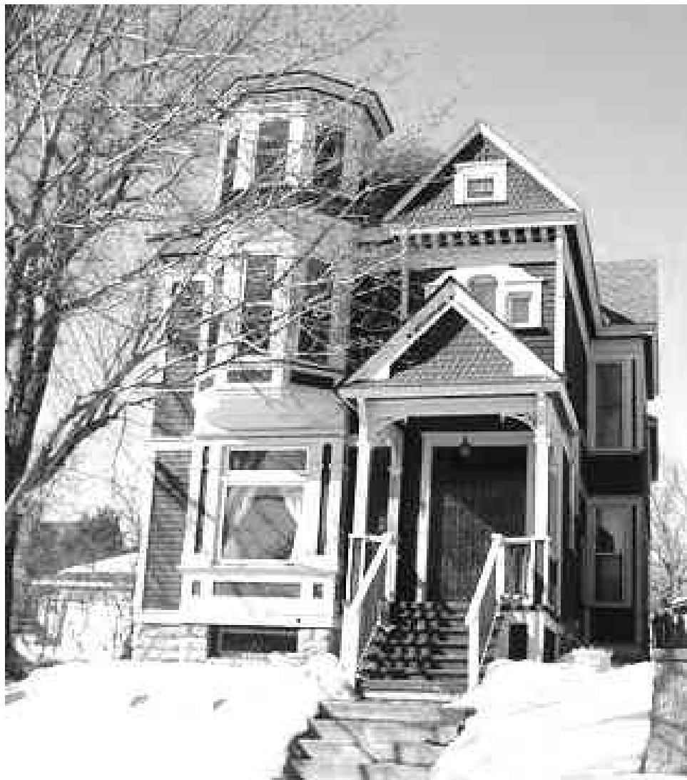
761 East 3rd Street, one of the homes on the tour