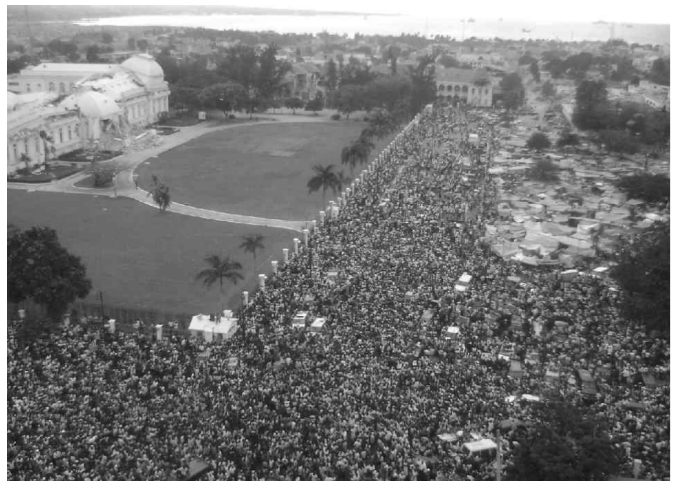
Haitians surround the collapsed presidential palace in a celebration of life

The president of Haiti declared that instead of the usual self-indulgent Mardi Gras-like Carnival this year, the Haitian people would observe a period of three days of fasting and prayer. This was astounding to me and other Americans, that a people already food insecure would purposefully fast. But the fast was to clear their minds and souls to make room for the purest way of moving forward with their country. Thousands of people gathered en masse in front of the Presidential Palace to celebrate that they were alive and that God would provide.