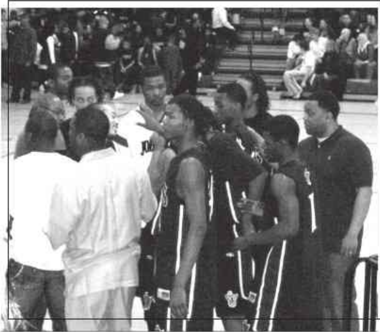
▲The team huddles before a game in their undefeated season.

But it's more than just a winning athletic team. Much more. While the Johnson team has been extremely successful on the basketball court, these young men have had a positive impact in the community off the court as well. They have become encouraging role models for the youth who currently participate in DBRC activities.