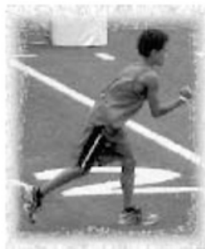
▲ An intense warm-up.

(August 5) We leave for Iowa tomorrow and I am so nervous. I feel like I'm jumping out of my skin. I'm scared that I'll get in last place and disappoint all the people that are coming down to see me. In some ways, I don't even want to go....I'm being told to think of all the hard work I've put in the past months and that just getting to Nationals is an accomplishment. But I still am nervous.