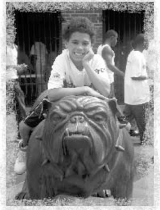
▲ Sitting atop the Drake University Bulldog.

(August 7) I'm done and so happy. My best jump going in was 12'9" and I made a goal of 13'4" because that is exactly 160 inches....My first jump was 12'6", which is okay. Then I did the next jump and got 13'4"! Yes! My coach and family were cheering. I was proud I had made my goal....Now the fun part—I finally get to swim. We got back to the hotel at 5pm and I immediately went in the pool and didn't come out till 9pm and then played hide-and-seek with other kids at the hotel....I met kids from about 17 different states and made new friends. It was a great trip.