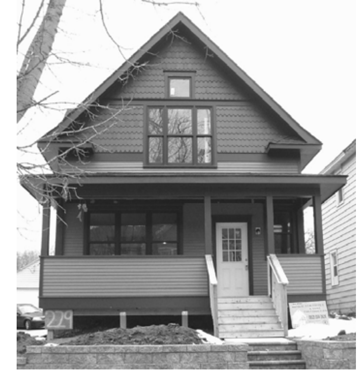
Here are some of the homes on the 2009 Dayton's Bluff Home Tour. Top: 660 E. 4th St. Above left: 245 Maria Ave. Above right: 229 Earl St. Below: 771 E. 6th St.

The 2009 Dayton's Bluff Neighborhood Home Tour will be held on Saturday, April 25th from 10:00 a.m. to 5:00 p.m. and Sunday, April 26th from 1:00 p.m. to 5:00 p.m. It is part of the Minneapolis/ Saint Paul Home Tour sponsored by the cities of Minneapolis and Saint Paul. The Home Tour is free of charge and open to the public. The complete listing of all the homes on the tour will be found in the Minneapolis/Saint Paul Home Tour Brochure which can be picked up at the library.