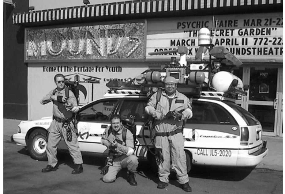
April 1, 2009 - A few ghosts may be fun but too many ghosts can get downright annoying. That was the case at the Mounds Theatre recently. So who're ya gonna call? These ghost busters had to thin the herd a bit, but don't worry, there are still plenty of spirits in residence. For more details check out www.ghostbustin911.com.