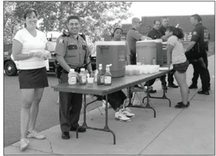
Kids, adults and police officers staff the refreshment table at the neighborhood Jr. League BBQ on July 8 at the rec center. More than 200 families enjoyed all the activities!

For more information, contact one of the locations below.