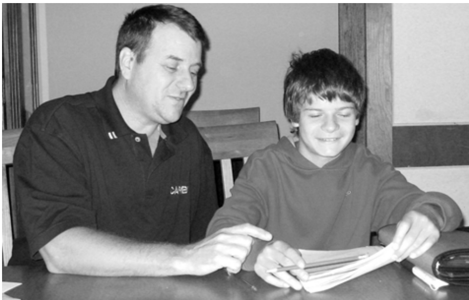
Homework offers an opportunity for the child to consolidate knowledge while building the relationship with his parent.