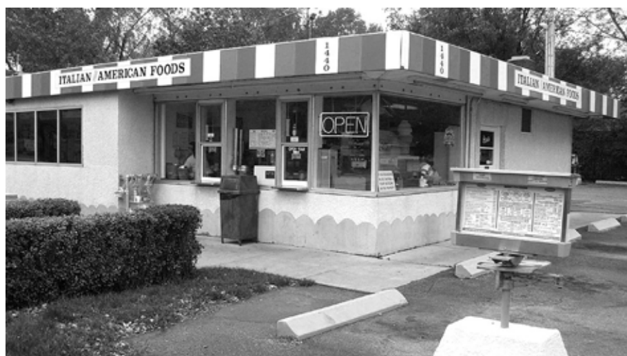
The Dari-ette at 1440 E. Minnehaha Ave. has been a fixture in Dayton's Bluff since 1951. It is open each year from late March through October.