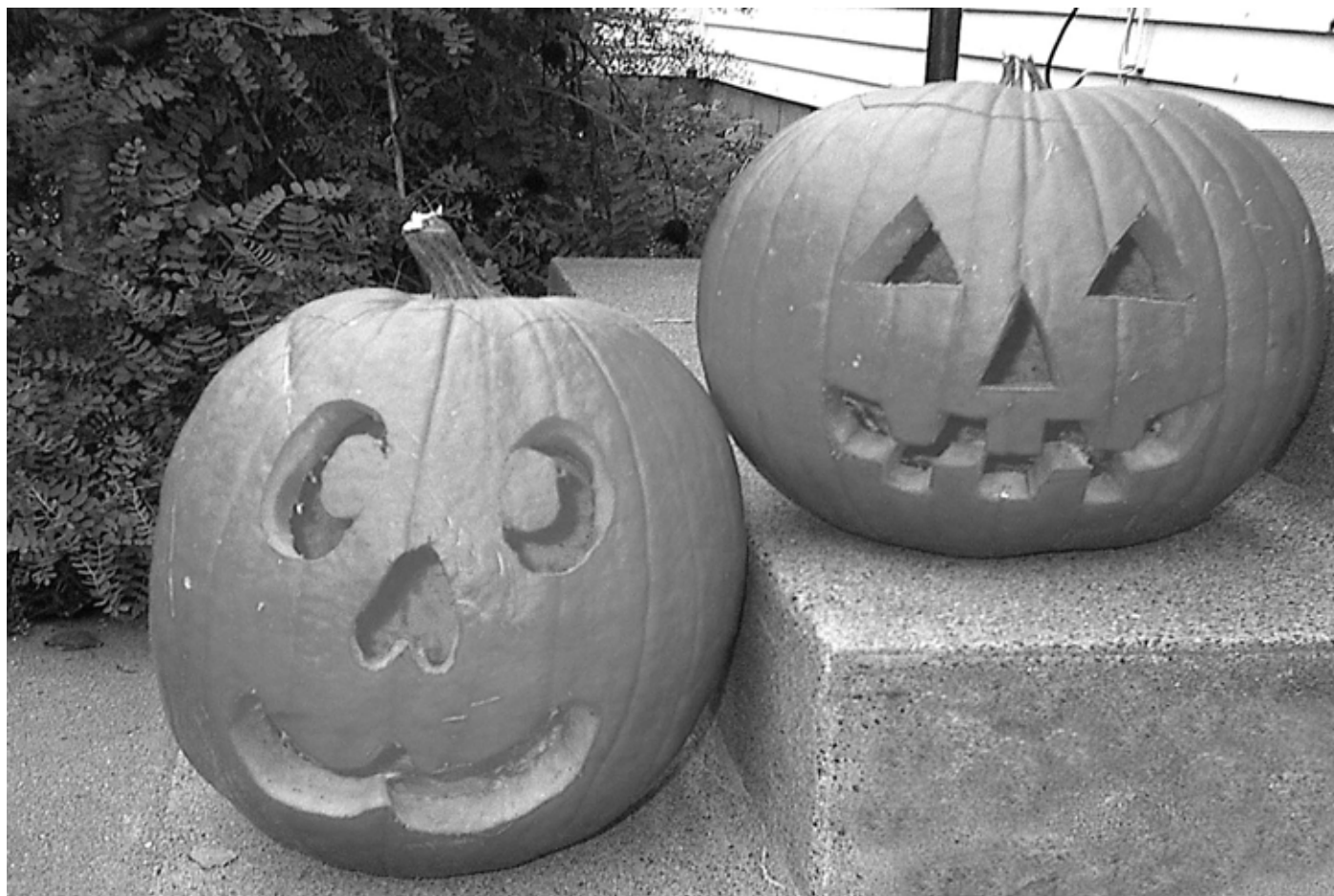
Jill (left) and Jack O'Lantern were born, raised and carved in Dayton's Bluff. They plan to spend Halloween brightly lit on a neighborhood porch before returning to their garden patch to help raise next year's pumpkins. Their carbon footprint is very small. They may be orange in color but they are green in spirit. See more about living green on pages 2 and 6.