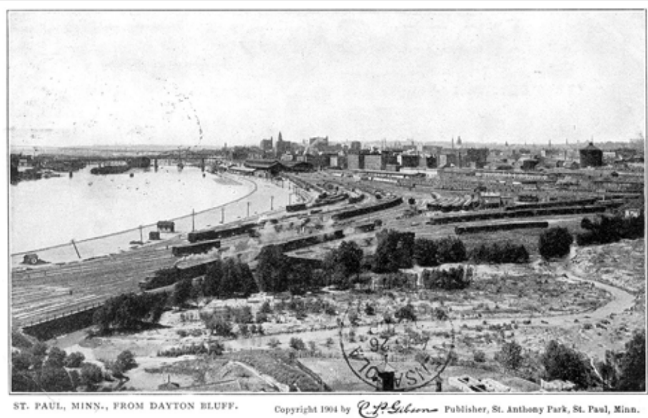
Postcard showing downtown St Paul from Dayton's Bluff, circa 1904