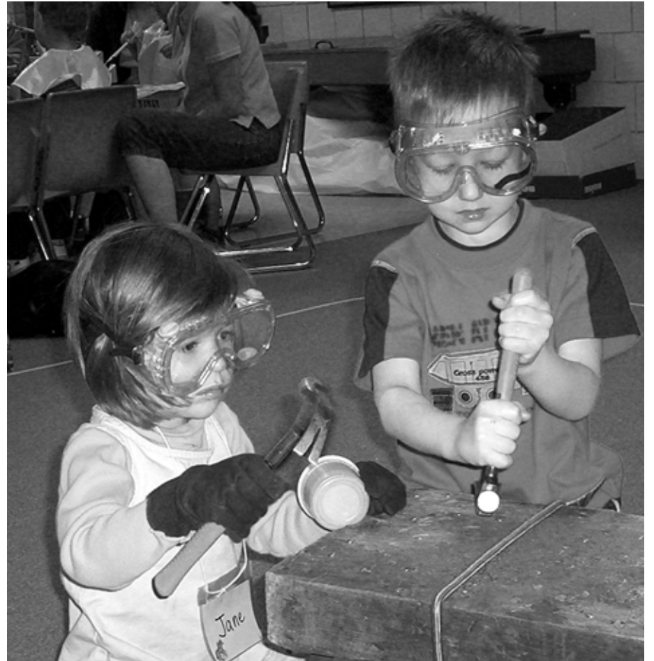
Young carpenters need the right equipment to hammer nails.

Theatre 9am-noon; Dance (ages 8-12) 1-4pm or Mosaic Art 1-4pm