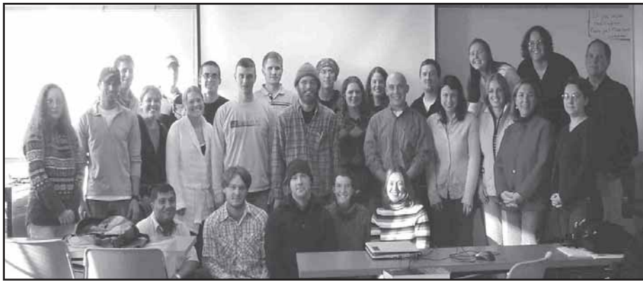
UofM Natural Resources Capstone Class working with the Dayton's Bluff Community Council to research and evaluate Dayton's Bluff parks, trails and recreational facilities.