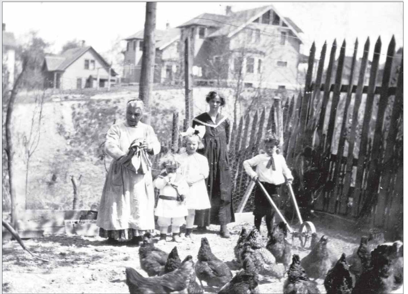
Chickens in the foreground, the Kelly residence in the back, circa 1920.

But like today, this new form of transportation brought some problems. Even before the 1920's, newspapers were starting to bemoan the lack of parking for