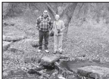
Enjoying a Swede Hollow Sunset

Discover the identity of this man and unearth his connection to a present-day Dayton's Bluff resident on page 6.