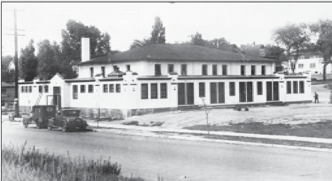
The Margaret Recreation Center, built in the 1920's.