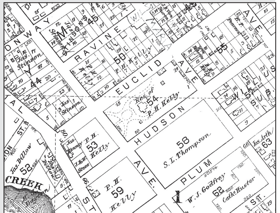
The layout of Dayton's Bluff, from an 1884 insurance map.

Whether or not they were a cause for concern, movies were obviously becoming an important social force. While theaters did exist in the previous era, most historians would agree that the Twenties