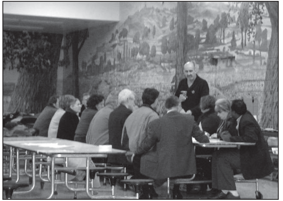
The democratic process in action at Harding High School.