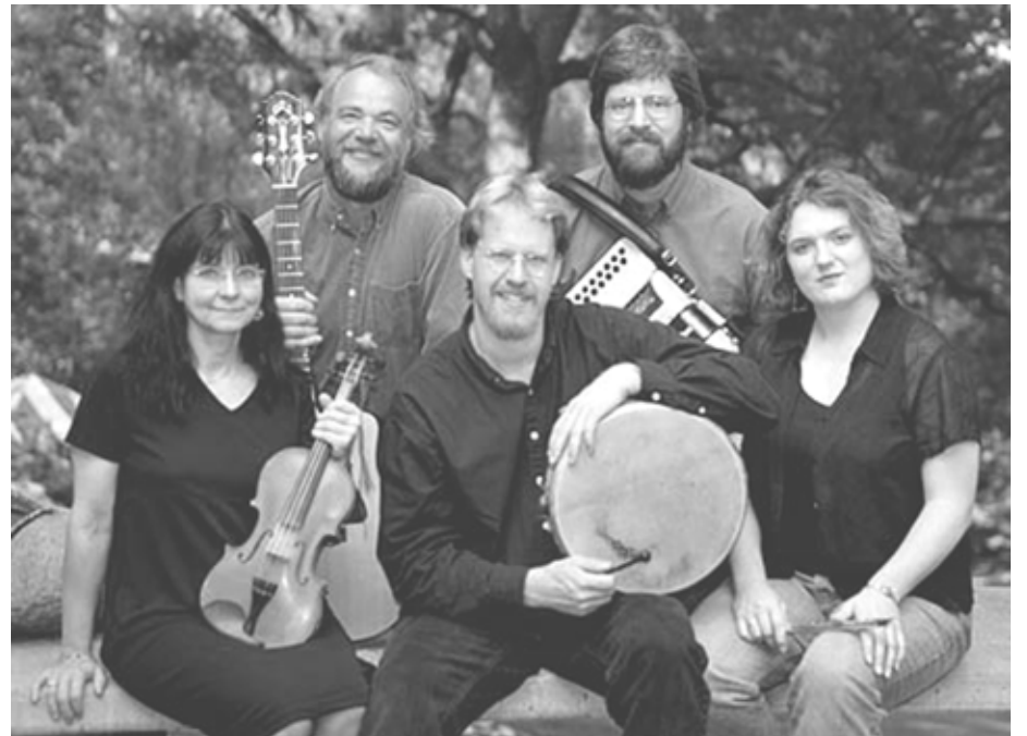
St. Paul's traditional Irish band Barra will play a 'ceili' at the Mounds Theatre as a fundraiser for the Dayton's Bluff District Council on March 19.

A ceili is a traditional Irish dance, much like traditional American square dancing in which people of all ages are encouraged to join in line and square dances. Dance instruction is provided before each dance. There is no need to bring a partner and no experience is necessary. In addition to jigs and reels, Barra's powerful female