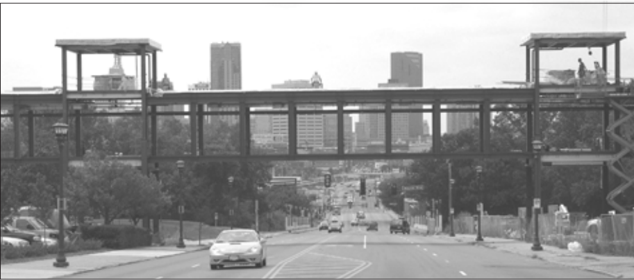
Looking down 7th St. towards downtown as the skyway to the new Metropolitan State/Community library was being constructed last year.

Metropolitan State is a finalist for an award, to be presented by former President Jimmy Carter, for community engagement and service learning, through our involvement in Minnesota Campus Compact. The opportunity to compete for this prestigious award is a reminder to us of how much our Dayton's Bluff community means to our mission and our success in serving the people of the metropolitan region. Thank you for your role in making Metropolitan State University the place "Where life and learning meet."