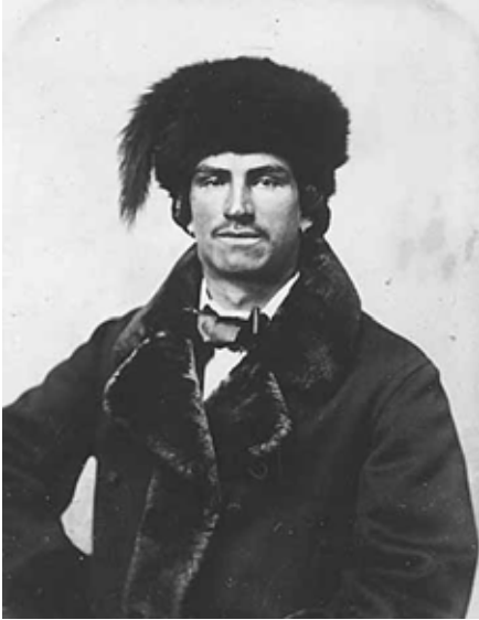
Minnesota Historical Society Mixed blood (Indian and French) fur trader around 1870.