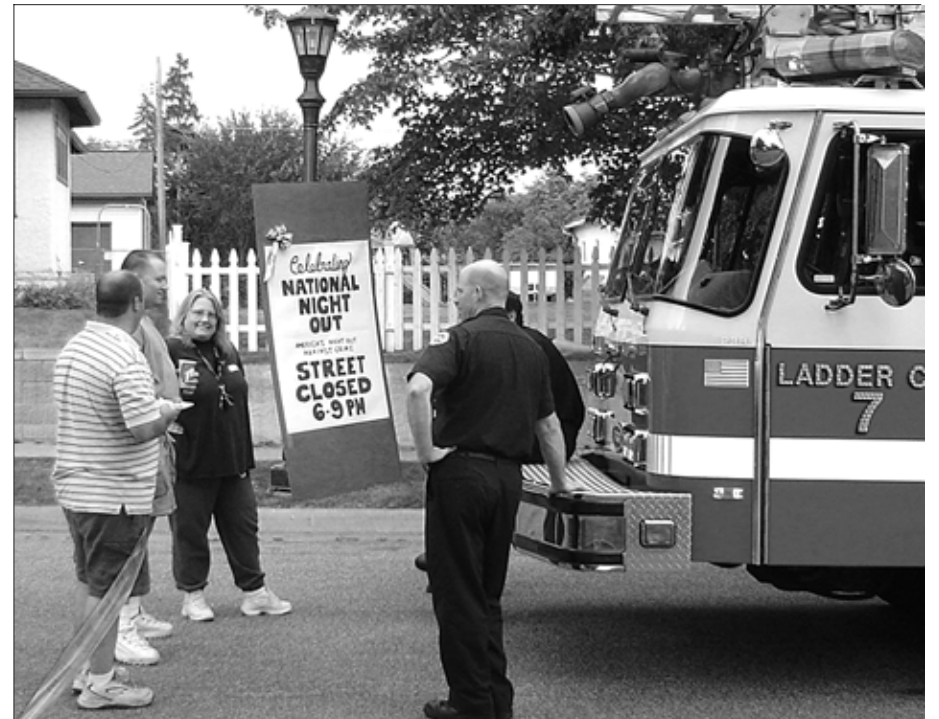
Neighbors on Clarence Street celebrated National Night Out in 2003 with a street party that had plenty of food and a visit by a fire engine.

Clarence between Point Douglas and McLean